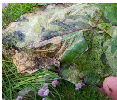
Figure 19: Extensive leaf miner tunnel damage to spinach leaf.