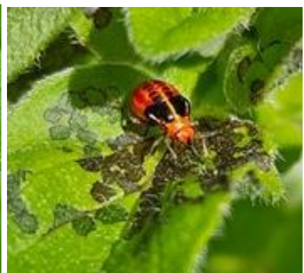
Figure 23: Four lined plant bug nymph and characteristic feeding damage.