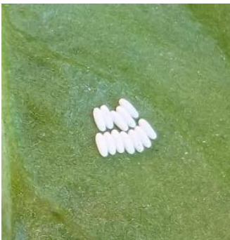
Figure 17: Leaf miner eggs (about 1/4 inch long).

Description: Leaf miners lay eggs that hatch within a week, and the larvae burrow immediately into the leaf. They feed on the leaf tissue for nearly 12 days forming “mines” and then fall to the soil and pupate. Nearly three weeks later, the next generation of flies will hatch, and the cycle begins anew. Crops most affected are spinach, Swiss chard, beets, and lambsquarter.