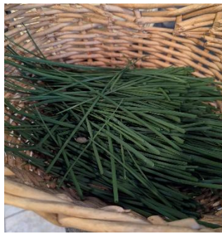
Figure 2: Chives.