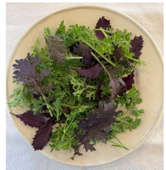
Figure 4: Spring greens, Photo: M. Albright, NJAES