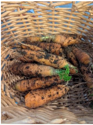
Figure 1: Overwintered carrots.