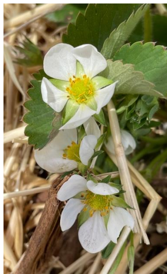
Figure 29: Flowers with yellow centers are healthy.