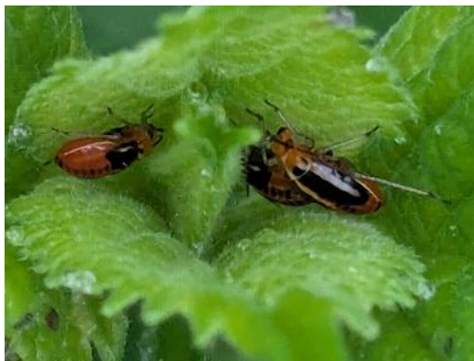
Figure 21: Nymphs of four-lined plant bugs.

These bugs feed on a variety of plants, including herbs (especially members of the mint family and basil), peppers, potatoes, currants and gooseberries, and many ornamentals. The damage inflicted by their sucking mouth parts can at first appear to be a fungus or other sooty disease, but close inspection reveals mechanical damage, with the injury going all the way through the leaf, not just resting on one surface. In great numbers, they can disfigure the plant and reduce its vitality. Their damage makes herbs appear unappetizing.