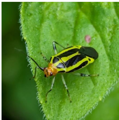
Figure 22: Four lined plant bug adult.