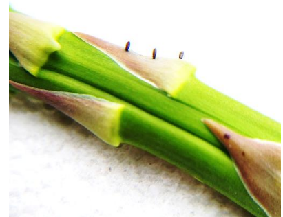
Figure 14: Close up of asparagus beetle eggs. The eggs will hatch in a week and feed for two.