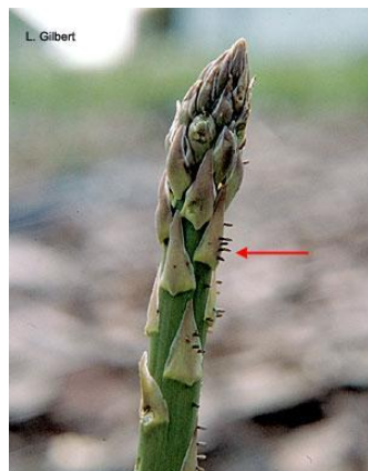
Figure 13: Asparagus beetle eggs