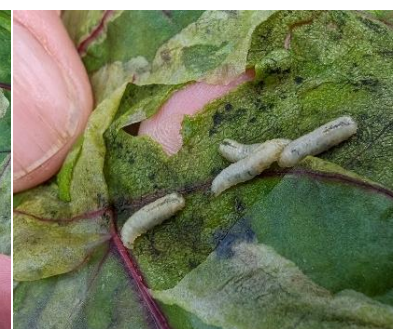
Figure 20: Leaf miner larvae inside leaf tissue.