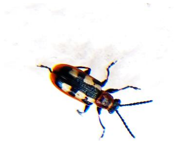
Figure 12: Common asparagus beetle adult (1/4 inch long).

There is also a Spotted Asparagus Beetle but they are usually active later in the season (mid-May).