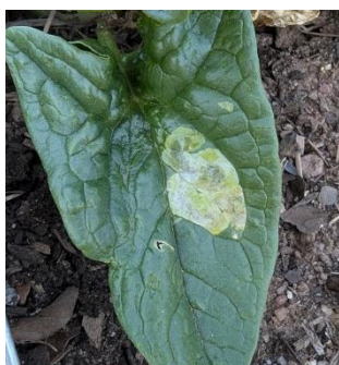
Figure 18: Leaf miner tunnel in spinach leaf