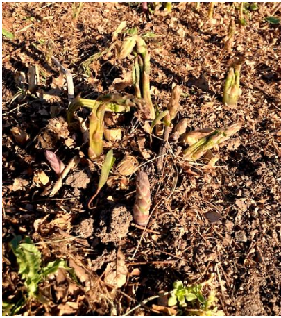
Figure 26: Multiple asparagus spears damaged by cold.