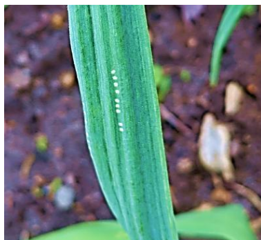
Figure 9: Allium leaf miner feeding and egg laying marks.