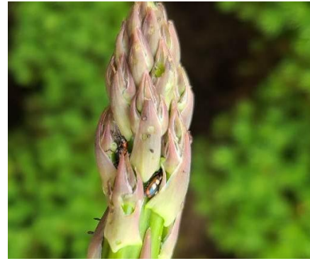
Figure 16: Asparagus beetles can be found feeding within spears, disfiguring, and destroying crops. Fast removal of eggs will help prevent damage and additional generations.