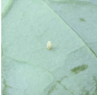
Figure 11: Egg of imported cabbageworm. Eggs are laid singly on the back of leaves. They are small but visible and can be hand removed.