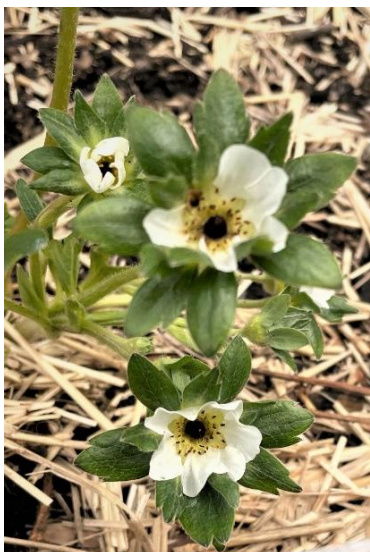
Figure 28: Strawberry flowers with black centers have frost / freeze damage.

Description: Open strawberry blossoms can be damaged by freezing temperatures and frost. Blossoms with damage have black centers and will not develop berries. Blossoms with partial damage will develop misshapen berries. Blossoms that are not open will survive and not be affected. Normal strawberry blossoms have yellow centers.