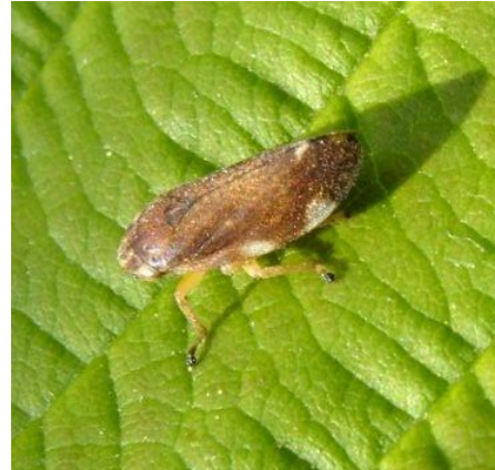
Figure 25: Adult meadow spittlebug.

Management: Spittlebugs are unlikely to cause significant damage to either vegetables or ornamentals. According to UConn, “the biggest problem with spittlebugs in the garden, whether it’s an ornamental or food garden, is the unsightliness of the spittle masses. Spittle and nymphs can both be washed off the plants with a steady stream of water. Normally, no chemical controls are recommended, and the spittle protects nymphs from contact insecticides. Not sure if there are enough spittlebugs to cause plants to be weakened? Look for distorted or stunted new growth, and of course numerous spittle masses on the same plant.”