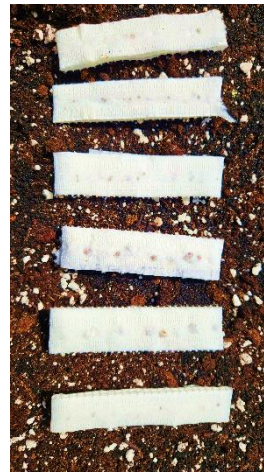
Figure 6: Various seed tapes ready to plant. Note the difference in seed sizes.