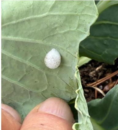
Figure 24: White foam from spittlebug.

Description: According to the University of Connecticut, spittlebugs are common and easily recognized by the white foamy ‘spittle’ produced by the nymph or immature stage of the insects as they feed. Adults are less commonly seen but are known as froghoppers (close relatives of leafhoppers, etc). There are anywhere from 30 to 60+ spittlebug species in the United States. All feed on plants, including both woody and herbaceous types. Some spittlebugs have broad host ranges and others narrow. There is usually only one generation per year and most overwinter in the egg stage inside overwintering plant tissue where they were deposited by the females in mid to late summer to early fall, depending on species. Hatch occurs in the spring, probably in May. Even though Spittlebugs feed by extracting plant sap/juice through needle-like mouth parts, they seldom cause notable injury to the plant. There are a few exceptions including the meadow spittlebug ( Philaenus spumarius ) and the pine spittlebug ( Aphrophora cribrata ).