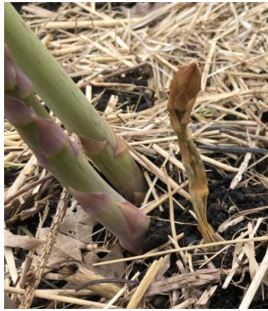
Figure 27: Cold damage to an asparagus spear. Once damaged, a spear will not grow.