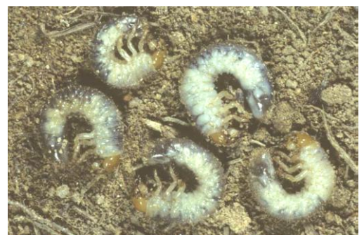
Figure 10: White Grubs.