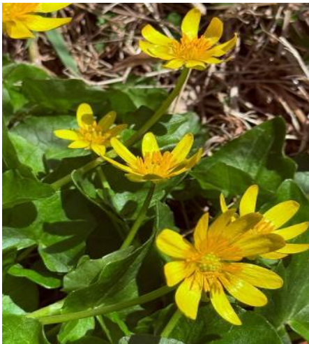
Figure 31: Detail of lesser celandine flowers

Description: Lesser celandine, an invasive non-native ephemeral, is one of the earliest spring blooming plants. Blooming occurs in March and April. It grows in low mounds of 3 to 5 inches and displays bright yellow flowers of 7 or more petals. The flowers measure about an inch in diameter. Its leaves are shiny, heart shaped, and dark green. This spring ephemeral spreads vegetatively by bulblets found at the base of the stems and tuberous roots. Seeds are also produced. Given moist rich soil, lesser celandine will grow aggressively in sun or shade. It easily out-competes native spring ephemerals.