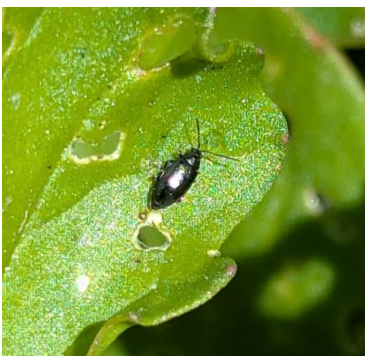
Figure 8: Flea beetle.