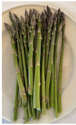
Figure 3: Asparagus.