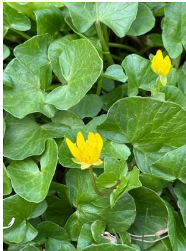
Figure 32: Lesser celandine leaves