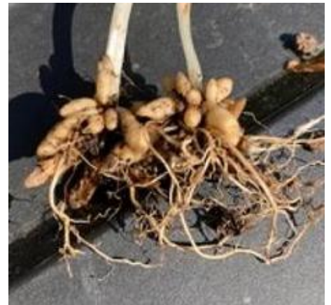
Figure 33: Close-up of lesser celandine bulblets and tubers

Management: Controlling lesser celandine colonies in the vegetable garden can be done by hand digging, though time and effort will be needed to remove all the bulblets and tubers. They should be bagged and disposed in the trash. The best time to do this is in the early spring when the plant is emerging and the flowers and leaves are visible. By the time most trees have leafed out, lesser celandine has vanished and the plant is dormant until next spring.