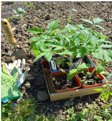
Figure 5: May transplants.

May is a busy month in the garden. Before planting take the time to evaluate your plot, especially the soil. Healthy soil with good texture helps produce healthy crops. Consider a soil test especially if you had issues last year. Add compost if you have it. Consider permanent or semi-permanent paths to avoid compression of the soil due to foot traffic. After planting try to keep soil covered as much as possible by growing plants and/or mulch. When deciding what and how much to plant, remember that more isn't always better. It's tempting to plant a community garden plot densely in an effort to maximize yield. However, planting too densely can backfire. Plants need proper spacing for adequate air circulation and access to nutrients.