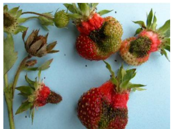
Figure 30: Misshapen strawberries resulting from partial damage by frost or freeze.