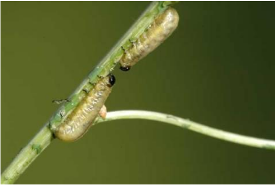
Figure 15: Asparagus beetle larvae (1/3 inch long when fully grown).